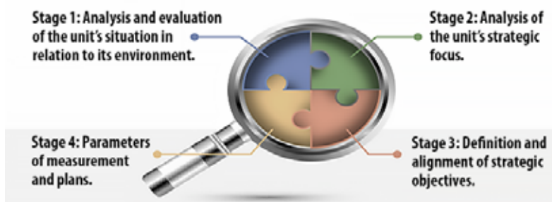
Figure 3: Proposed stages for the development of the management control system for a military unit